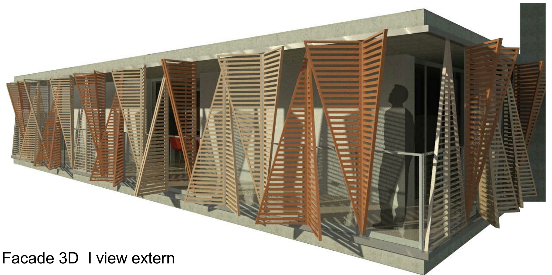
Facade 3D | view extern